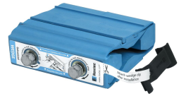
Wedge &amp; Wedge kit

For detailed information, please visit roxtec.com .